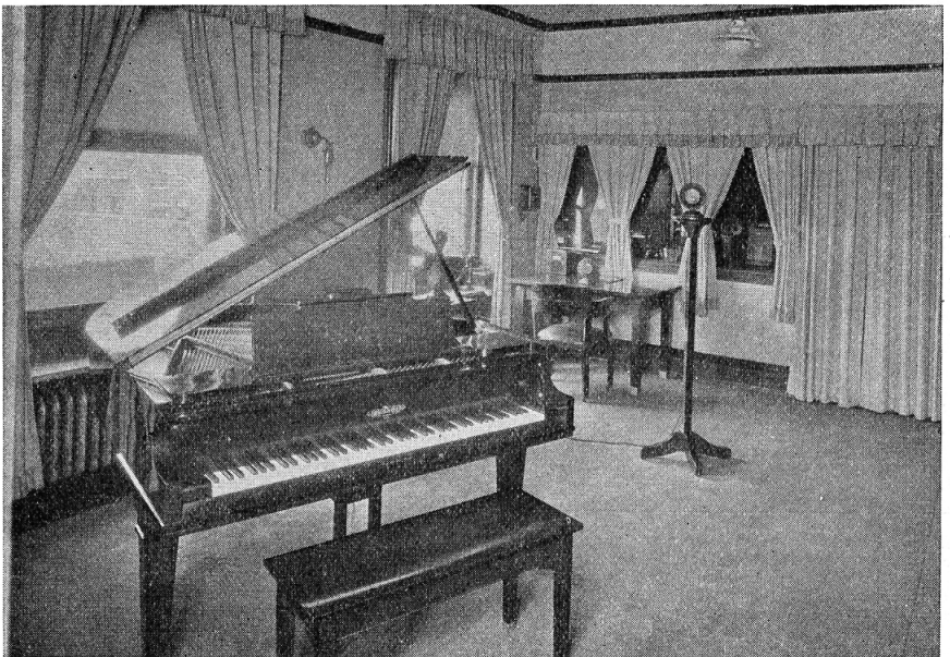
Studio of WJAX, the Union Trust Company, Cleveland, Ohio

Union Trust Company's project of a radio financial news service to the farmers and business people is unique and promising.